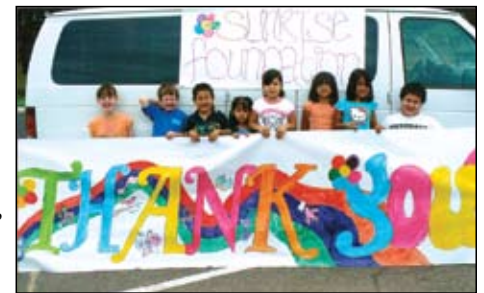
Autumn House Children

As the hot weather set in, a really cool surprise followed with a financial gift from the Sunrise Foundation for a new, air-conditioned, 12-passenger van to transport children to and from A New Leaf's Autumn