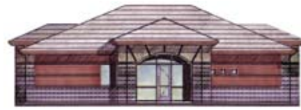
JAG Youth Center

It's been years in the making. Now, through the generosity of the Glendale Community Development Block Grant, the JAG Youth Center has found a new and improved home, along with A New Leaf's West Valley Administration Office. We are grateful to the City for all your contributions. Thank you, City of Glendale.