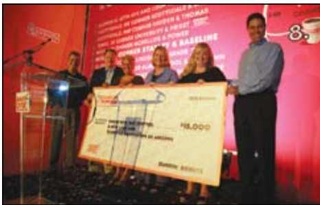
Dunkin' Donuts Grand Opening

Amidst local dignitaries, coffee and fireworks, Dunkin' Donuts in Mesa presented A New Leaf with $5,000 as a charity of choice. This generous gift will help provide shade on the playground